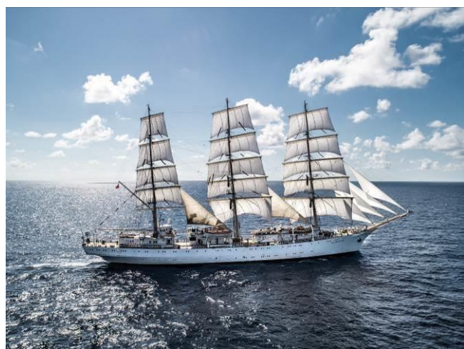
Figure 4. GMU's tall Ship Dar Młodzieży

After saying goodbye to Japan, "Dar Młodzieży" started her longest ocean stage of this expedition - across the Pacific to the ports of the west coast of the United States. After 32 days she arrived in San Francisco covering the distance of 5,311 nautical miles. For the first time in his history the tall ship visited the ports of California - San Francisco and Los Angeles where they spent the Christmas Eve. The New Year's Eve was celebrated on the way to Mexican Acapulco. The culmination of the trip - World Youth Day was held in Panama. The crew comprised of students and winners of the competition participated in that extraordinary all-world meeting. The crew delegation was received by His Holiness Pope Francis.