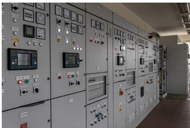
Figure 5. One of the laboratory at Faculty of Electrical Engineering

The basic aim of Gdynia Maritime University has always been to educate highly qualified personnel for maritime industries. Professional careers of this Faculty graduates have been pursued in this specific direction for many years. The Faculty educates electrical engineers, specialists in operation of ship and land-based electrical equipment and automatic control systems. It also educates electronics engineers, specialists in designing and operation of electronic circuits, facilities and systems dedicated for land-based, sea and ship communications systems as well as stationary and mobile telecommunication and computer tele-informatics networks.