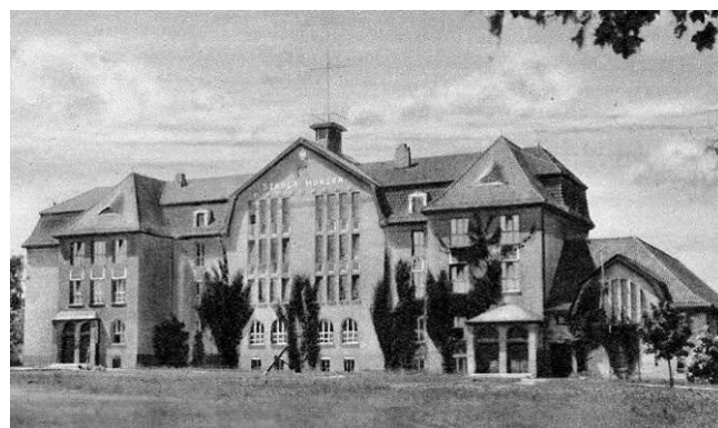
Figure 1. Main building of Maritime School in Tczew, 1920

at the end of 60s of last century the School had in its structure three faculties: Navigation Faculty, Marine Engineering Faculty and Administration-Economic Faculty.