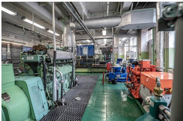
Figure 6. One of the laboratory at Faculty of Maritime Engineering

The Faculty of Marine Engineering of Gdynia Maritime University is the first university faculty in Poland to obtain and hold ISO 9001 quality certificate, which is a guarantee of a high quality of education and research.