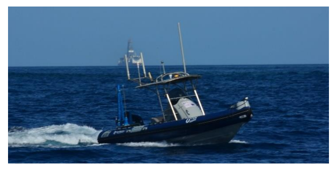
Figure 3. UTEK unmanned boat tested at PLOCAN test-site

A multidisciplinary group of Spanish research centers, companies and public agencies, under the coordination of DGMM (General Directorate of Marine Merchant) are joining forces since late 2020 in order to setup a working group on autonomous maritime navigation. Its main goal is to setup the right national framework to develop and operate USV and autonomous ships that currently are under development [56, 78]. PLOCAN is one of the active partners providing both test-site capabilities and the ownership of the first autonomous boat flagged in Spain [24].