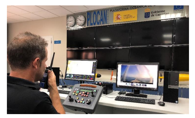
Figure 4. USV - Shore Control Centre (SCC) at PLOCAN facilities

One of the biggest challenges in developing the technology for MASS is to demonstrate that unmanned systems are at least as safe as a manned ship system and to provide the Shore Control Centre (SCC) with adequate situation awareness. In case of emergency situations such as stranding or evasive manoeuvring, the ship systems should be remotely monitored and controlled by the operators of the SCC receiving crucial information via satellite at short time intervals (Figure 4). The SCC should also have a smart alarm system and the ability to switch to the manual control mode in case of doubt on the autonomous system [38, 63, 68].