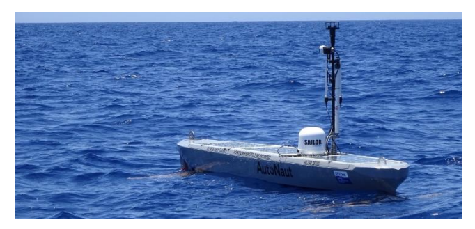
Figure 2. AutoNaut ASV trials at PLOCAN test-site facilities

All of them are fully or partially powered by endless ocean-energy sources. In parallel, half-way to autonomous ship concept, developments such Sea-KIT [73]; Ocean Infinity [59] have also been released for specific seabed-mapping and survey-services in industry applications at ocean-basin level worldwide. These developments, many of them already commercial, demonstrated that specialty USV could withstand the harsh ocean environment for extended periods and their software and systems were reliable enough for extended voyages and missions.