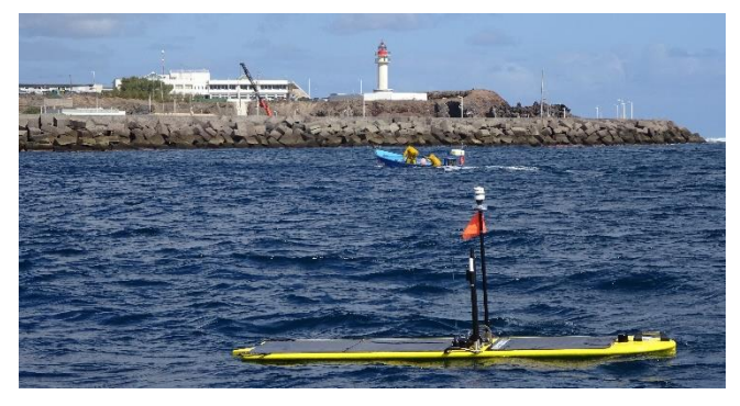
Figure 1. Wave Glider ASV starting a mission conducted by PLOCAN

The initial reference on the path to autonomous ships is technical. The core technologies that enable unmanned vessels have come about largely due to developments in other fields [8, 15, 22, 23]. Improved USV capabilities allow to undertake missions both in coastal and open-ocean areas for long periods of time due to a more efficient power and propulsion systems based in some cases on renewable energy sources wind, waves), Fig. 1. State-of-the-art (solar, broadband telemetry systems enable remote real-time operation and decision-making by the operator. In parallel with the mechanical and electronic system architecture improvements for USVs, software advanced rapidly as well, with special focus on autonomous navigation methods and techniques in compliance and contribution to ocean digitalization and e-navigation framework initiatives.