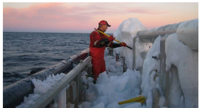
Figure 3 Removing ice on the aft deck prior to a field training exercise