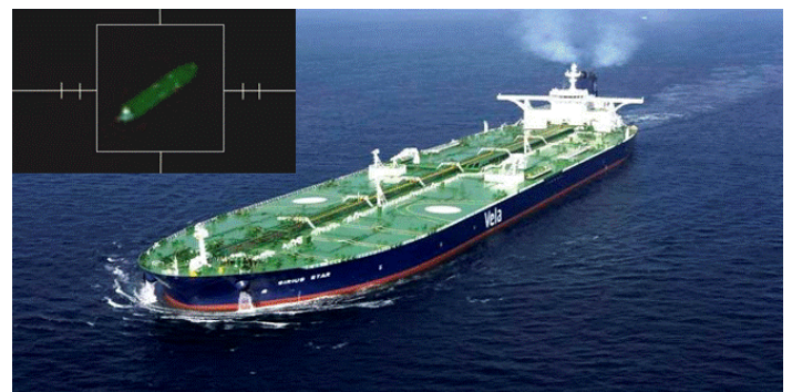
Figure 3. Tanker Sirius Star and satellite imagery of the tanker anchored near Gaan on the Somali coast