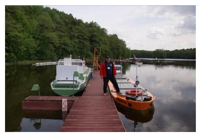
Figure 11. The Ship Handling Research and Training Centre at Iława

This was expected by several customers, for which we offered until today only basic manned model course on ship handling (organised according to STCW 1995 Code and to A.960 Resolution). New proposed training courses are introduced in order to keep pace with the development of technology of shipping and shipbuilding, introduction of new ship types having different manoeuvring characteristics, and fitted with new propulsion and control devices.