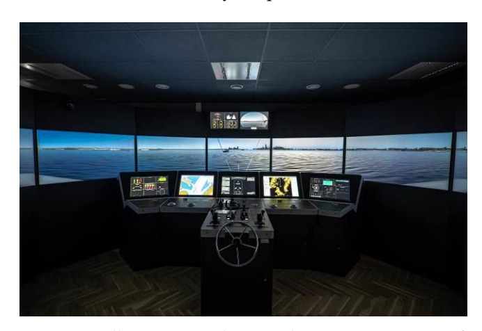
Figure 8. Full Mission Bridge Simulator at Department of Navigation

The scientific and didactic activities of particular Departments of the Faculty of Navigation are characterised by high thematic diversity, which results from a vast variety of specialisations.