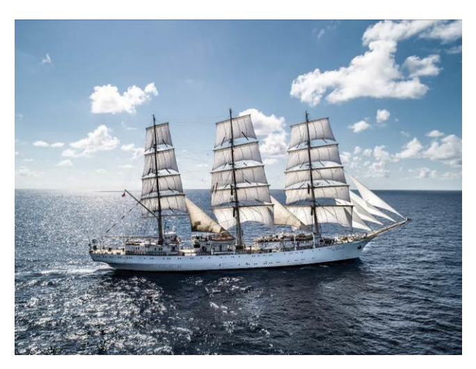
Figure 4. GMU's tall Ship Dar Młodzieży

After saying goodbye to Japan, "Dar Młodzieży" started her longest ocean stage of this expedition - across the Pacific to the ports of the west coast of the United States. After 32 days she arrived in San Francisco covering the distance of 5,311 nautical miles. For the first time in his history the tall ship visited the ports of California - San Francisco and Los Angeles where they spent the Christmas Eve. The New Year's Eve was celebrated on the way to Mexican Acapulco. The culmination of the trip - World Youth Day was held in Panama. The crew comprised of students and winners of the competition participated in that extraordinary all-world meeting. The crew delegation was received by His Holiness Pope Francis.