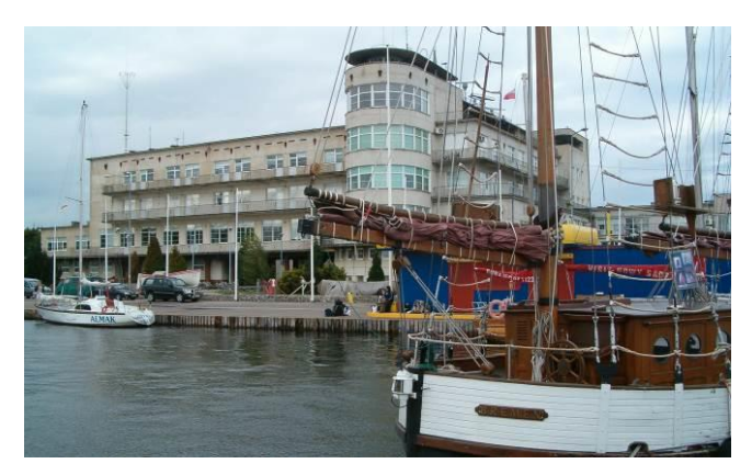
Figure 13. The Faculty of Navigation in the summer season

Our main goal is the analysis of and the consequences resulting from the present challenges that the maritime universities face, as well as the multi-aspects discussion of some ways and solutions based on the Gdynia Maritime University's experience, how to overcome these challenges. The presented approach deals with two domains, maritime education and marine transport–based research, respectively.