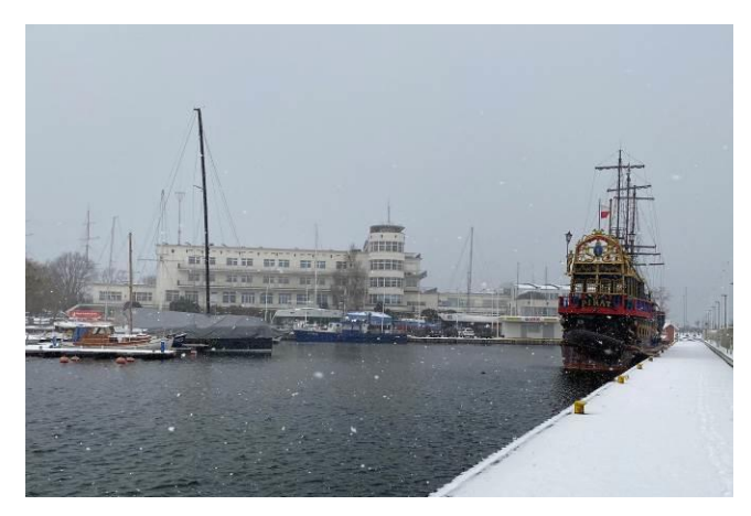
Figure 14. The Faculty of Navigation in the winter season