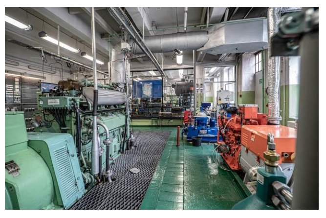
Figure 6. One of the laboratory at Faculty of Maritime Engineering

The Faculty of Marine Engineering of Gdynia Maritime University is the first university faculty in Poland to obtain and hold ISO 9001 quality certificate, which is a guarantee of a high quality of education and research.