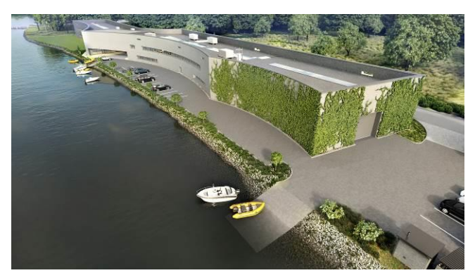
Figure 10. Mockup of the planned new headquarters of the GMU Maritime Institute, with location in Gdańsk next to the fortress Wisłoujście

Offshore surveys conducted by the Institute require collecting and processing large amounts of measurement data, which is why its disc array (of 1.0 PB capacity) operated by a strong team of software developers and IT professionals focusing on the analytical processes is an information centre of the Institute.