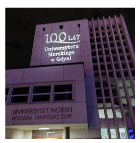
Figure 12. Gdynia Maritime University, The Faculty of Navigation is celebrating the 100th Anniversary of GMU

transport, and their main emphasis is on the implementation of new technologies, effective and reliable technical and organizational solutions that are user-friendly and environment-friendly, such as green shipping, development of e-navigation concept, offshore technology, renewable energy, MASS (Maritime Autonomous Surface Ship), reduction of gases emissions, etc.