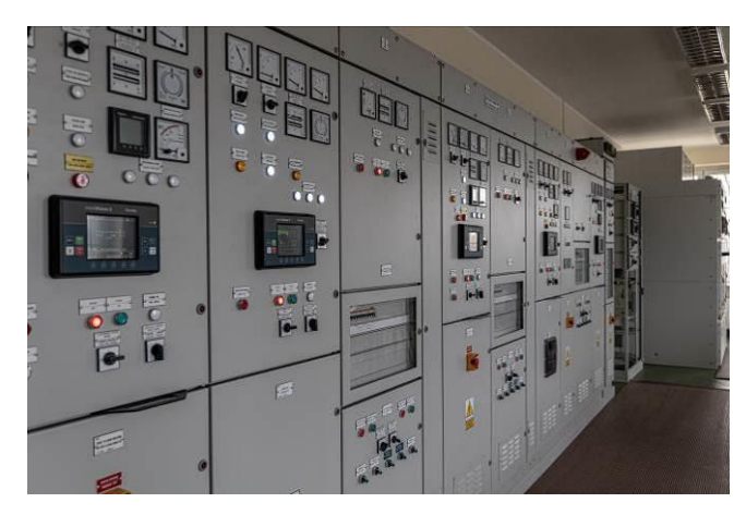
Figure 5. One of the laboratory at Faculty of Electrical Engineering

The basic aim of Gdynia Maritime University has always been to educate highly qualified personnel for maritime industries. Professional careers of this Faculty graduates have been pursued in this specific direction for many years. The Faculty educates electrical engineers, specialists in operation of ship and land-based electrical equipment and automatic control systems. It also educates electronics engineers, specialists in designing and operation of electronic circuits, facilities and systems dedicated for land-based, sea and ship communications systems as well as stationary and mobile telecommunication and computer tele-informatics networks.