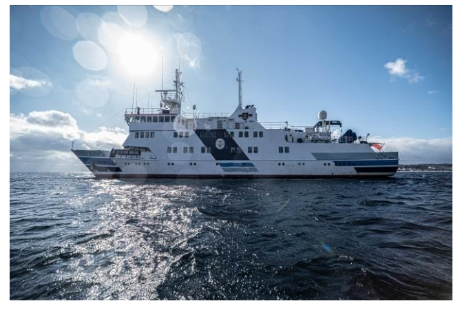
Figure 7. GMU training vessel Horyzont II

The faculty has modern didactic and scientific laboratories and equipment, including engine room simulators.