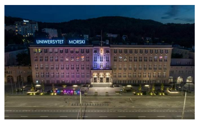
Figure 3. Main building of Gdynia Maritime University, 2020, Gdynia, Morska Str. 81

The programs of studies satisfy both Polish educational standards provided by the Ministry of Education and also the requirements of the International Maritime Organization – IMO. The academic staff – representing doctor of science degree and scientific titles of a professor accompanied, in many cases, by the highest marine diplomas of a Master Mariner and Chief Engineer – supported by the laboratory facilities offering 25 specialised simulators and ISO 9001:2015 education quality management system implemented by the University.