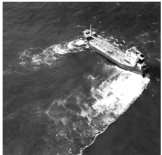
Fig. 3. M/V Esso Plymouth equipped with Single Schilling Rudder provide crabbing ability when used with a bow-thruster

The example of propulsion-steering system consist of Schilling Rudder and bow-thruster shows on figure 3 the possibilities of the realization of the transverse movement (crabbing of the vessel).