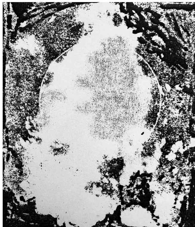
Figure 2. Photograph of the same indicator under the same conditions as in Fig. 1 when receiving a circular polarization echo (at a distance of 75 km from the center of the echo circle, objects are in the area of the rain shower echoes)

From the point of view of synoptic information, precipitation is characterized by frontal and air-mass origin. Air-mass precipitations are subdivided into thunderstorms, showers, and widespread precipitation [5, 6]. According to the structure, the