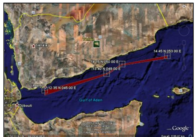
Figure 1, Maritime Security Patrol Area 2008 (MSPA)

of Aden (Figure 1.), with the intention of channeling merchant vessels through a corridor that would in theory afford greater safety, because defensive measures would be more effective when concentrated in a smaller area. Thanks to the coalition patrols of warships and aircrafts, the safety of all vessels travelling in the basin was ensured. Easier control, monitoring, and the possibility of faster response, scored big chances of international forces in the fight against widespread piracy and everything seemed to coming back to normal. But all these measures, although ensuring the safe passage of some merchant ships, and preventing some boardings, could not avert a further large number of hijackings and an even greater number of unsuccessful attacks. The situation began to worsen and pirates started to attack more often and farther than ever after hijacking of MV Sirius Star - an oil tanker – in November 2008 2 . It was clear that the MSPA did not achieve the expected results, and the passage of the vessel inside the corridor involved increasing risk. There were not enough warships patrolling MSPA, and it was quite a widespread area.