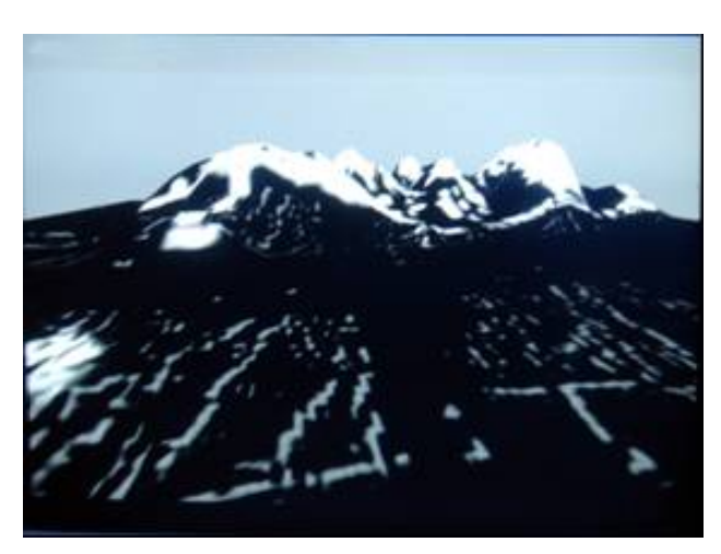
Fig. 4. Gulf of Gdańsk 3D radar screen

The most important is order all objects from farthest to nearest. DirectX program offered Z-Buffer algorithm done this task. It is memory structure storage coordinate Z (W for radar picture) each pixel. For each screen parameter W in the pixel is compared with this value from previous screen. Next step is texture mapping its mean added 2D bitmap to 3D triangular objects. Minimum two different dimension bitmap are used. When objects closed to observatory is used bigger bitmap and when distance to the object growing up the bitmap is changing for smaller. The library builds faster radar pictures in 3D structure.