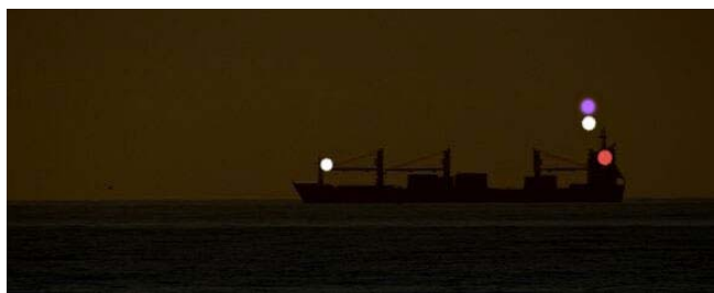
Figure 2: Should ships navigating in autonomous mode carry a special identification light? The behavior of the navigation AI maybe different from the behavior of normal, manned ships. The light could be purple which is a color that is not used for other purposes. The same discussion and color choice is debated in the autonomous car industry.

The assumption above is that if autonomous ships always follow COLREGS their behavior will be a hundred per cent predictable. But as we have seen above, this might not be true if e.g. the spectrometers onboard the autonomous ship does not interpret “restricted visibility” the same way we do (and therefore Rule 19 should or should not be used).