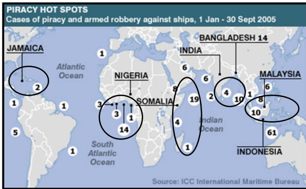
Figure 1, Piracy hot spots, http://www.southchinasea.org/docs/Threats.pdf , 28.12.2008.

The article focuses only on one but very significant region, the Gulf of Aden and the Somali Basin, although the problem is very extensive and present in other regions as well. The Gulf of Aden and the Somali Basin is strictly connected with Somalia, a country situated in the Horn of Africa, and problems related to this country. To understand all aspects of piracy there it is necessary to learn briefly about Somalia as an African country.