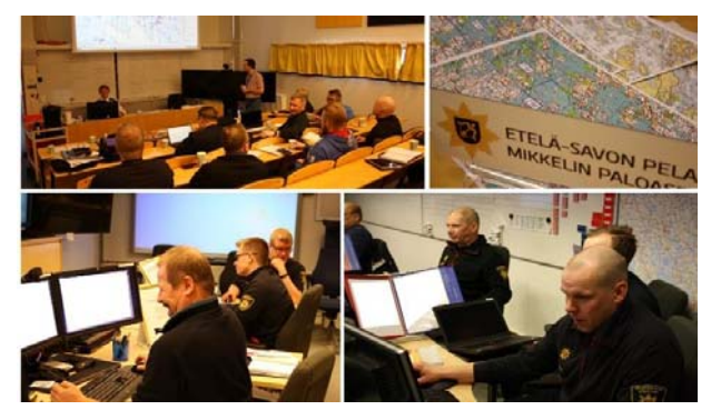
Figure 4. Tabletop exercise conducted in the Incident Management Center of Southern Savonia Rescue Service, and observers monitoring the progress of the situation (Halonen 2018).

mimic an actual incident (Patrick & Barber 2001) and offers the participants an opportunity to clarify roles and responsibilities, discuss priorities and establish inter-agency agreements in a realistic, but nonstressful situation (Gleason 2003; IPIECA & IOGP 2014; Halonen 2018). This fosters cooperation and communication, and improves tactical response skills. Therefore tabletop exercises are considered useful in training multi-agency collaboration in joint response operations. Typical training objectives include incident command management, planning of response tactics and use of communication and situation awareness systems.