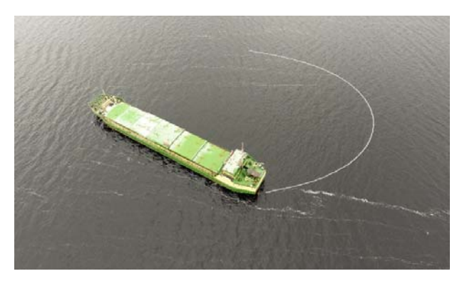
Figure 5. Exercise target vessel assisting in Arvinsalmi fullscale oil spill response exercise in North Karelia (Pitkäaho 2017).