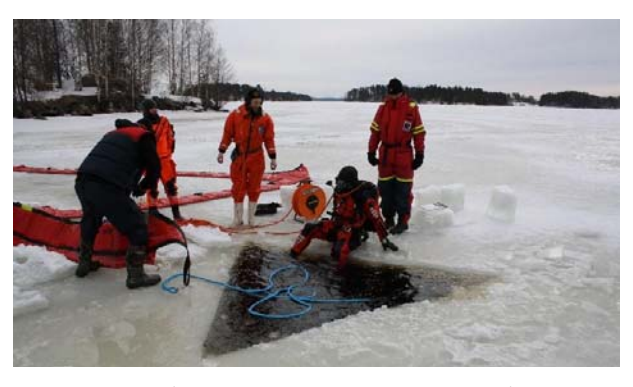
Figure 3. Northern Savonia Equipment Deployment Drill testing the most suitable boom model for under-ice boom-deployment (Halonen 2018).

Drills are exercises, in which personnel and response equipment are deployed and operated in a field environment (Leonard & Roberson 1999). Drills usually focus on a specific function or a single task (Halonen 2018) and are used to provide training on new equipment, validate procedures, and maintain or improve technical skills (Gleason 2003; IPIECA & IOGP 2014). Drills offer an opportunity to assess the functionality of the equipment and to find the most feasible response methods or techniques for specific operating environments. The greatest advantage of equipment deployment exercises is that they demonstrate the capabilities of the responders to employ the equipment as well as reveal the time the deployment takes (Leonard & Roberson 1999).