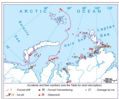
Figure 1. Accidents in Kara Sea since 1900, induced by ice conditions.

As an illustration of the “Accidents data base” construction the short extraction for the Kara Sea is presented here. The example includes only one map (figure 1) for accidents which had been induced by hard ice condition, explanation to the map and the beginning of the table with short description of the accidents. It should be stated that the ice drift has usually very complicated and chaotic configuration and only the main direction without any loops and zigzags is presented on this map. References in the table are given on only the essential sources in Russian and in English.