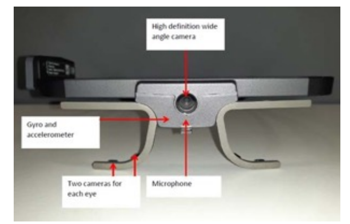
Figure 4. The eye movement tracking glasses of ISTLAB [9]

The human element, i.e., behaviour of the pilot and the officers on the deck of the piloted ship can be analysed in several ways. It is possible to record all control actions and the voice communication, and the whole exercise analysed afterwards. The operation of the pilot or the officer of the watch of the ship can be analysed also using eye movement tracking. Eye movement tracking reveals the importance and the usage of different items shown on the displays of the user interface of RPU and the ship's bridge. According the first tests in ISTLAB the usage of available information varies significantly during the pilotage process [9]. The eye movement tracking glasses if ISTLAB are shown in Figure 4.