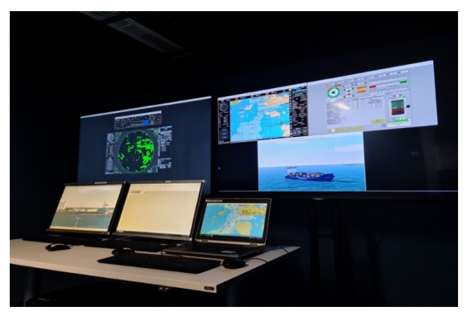
Figure 3. Displays of the Remote Pilotage Unit

The main components of the ISTLAB simulator setup for remote pilotage are the bridge of the vessel to be piloted and the control room for the remote pilot. In Figure 2, the bridge of the piloted ship is described by the big circle (Ship A), and the remote pilot unit is marked with the abbreviation RPU. The bridge of Ship A has a 360 degrees visual system. Data from Ship A is transmitted to RPU utilizing the internal data network of the Wärtsilä simulator system. A sample configuration of the displays at RPU is shown in Figure 3.