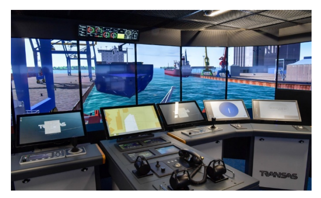
Figure 1. The main bridge of the navigation simulator at SAMK, Rauma

Anyhow, simulator testing has obvious limitations. Simulation is always an approximation of the phenomena of the real world. Simulation can never be better than the undelaying models it is based on. The accuracy and realism of modelling the actual systems and processes is crucial. Another major difference between simulation and a full-scale test in real environment is psychological of its nature. The experienced risk of using the simulator versus using the real equipment has an impact on the human behavior, i.e., the risks of harmful consequences of wrong decisions or actions of the human operator. It is mentally more stressful in demanding conditions to navigate a real ship than to navigate a simulated ship! Full-scale tests can also reveal unpredicted features, design flaws and malfunctions of the real equipment that were not known and hence not included in the "ideal" models of the simulated equipment. Also, some other factors, such as trainer-trainee interaction, may influence perceived level of the fidelity of the simulation, as addressed by Wahl [11].