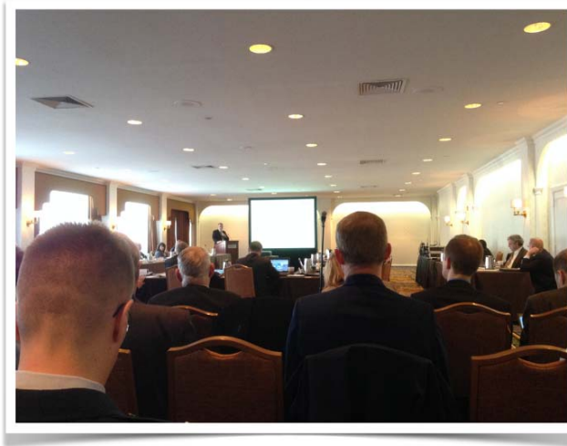
Figure 2. Meeting of the U.S. National Space-Based Positioning, Navigation, and Timing (PNT) Advisory Board.