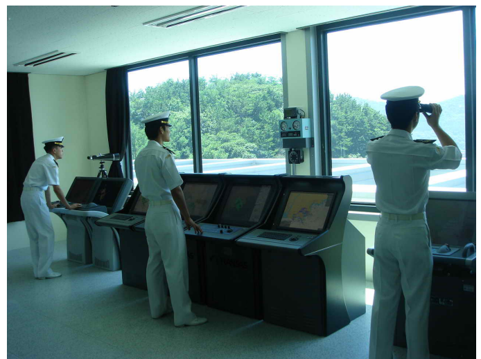
Fig. 2. ECDIS Training with Transas NTPro 4000

ECDIS can be installed on the simulated bridge as Master and Back Up station, while Instructor’s workplace can include Slave station to observe trainee’s behavior online; supervise his actions and collect the information for the further analysis and debriefing.