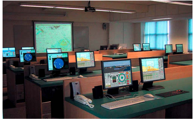
Fig. 1. ECDIS Class

Transas ECDIS as a part of the simulated ship’s bridge and is therefore highly adaptable to proficiency-based training in ECDIS.