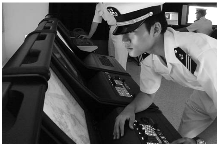
Fig. 6. Trainee operating ECDIS

It is important that training is carried out on one type of the system for all the trainees. During the course, trainees are often inclined to share their discoveries and solutions when trying to perform a new task. This exchange would be limited if some trainees had one type of ECDIS and others in the same class had another. That prospect would likely be overly taxing to the trainer, as well. Another point here is that it is really impossible to teach “ECDIS in general”. Proficiency with complex equipment is a specific task. What can be emphasized to trainees who expect to find a different brand of ECDIS on board ship is that, thanks to the type-approval process, basic functions will be available even if the Officer faces a different user interface or menu structure from another manufacturer.