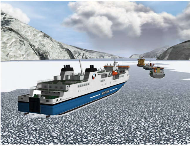
Fig. 3. Visualisation in Transas NTPro (ice conditions)

When used as a part of Transas NTPro simulator, Navi-Sailor ECDIS gives a unique possibility not only of Operational training but also the Management training enabling the trainee to select the most reliable and precise sensor for vessel position defining, to overlay the radar image on electronic navigation chart, use UAIS information, make records in the log book, record and playback vessel progress and navigation environment data coming from navigation sensors during the training session. Furthermore ECDIS training, provided by Transas customers in case of joint application of NTPro and GMDSS / VTMS equipment, guarantees the opportunity to obtain experience in operation with coastal control stations and ship service radio stations and allows the additional training in E-navigation which is now widely demanded in the maritime industry.