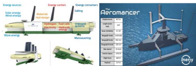
Figure 5. Comparison zero-emission car carrier proposed by Wallenius Wilhelmsen (on the left) with zero-emission Aeromancer system proposed by Inerjy (on the right).

There is also another quite interesting green technology proposed by Wallenius Wilhelmsen [10] for zero-emission car carrier (see figure 5) with length overall 250 m, height 30 to 40 m, beam moulded 50 m, design draught 9 m, design speed 20 knots (maximum) and 15 knots (in service), vehicle capacity 10000 cars (based on today's standard units) with design cargo deck area 85000 m 2 and eight cargo decks, of which three are adjustable in order to accommodate high and heavy vehicles and equipment.