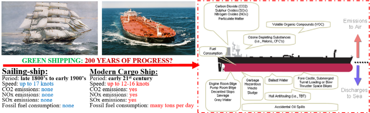
Figure 1. Comparison of the environmental impacts brought by shipping observed in the last 200 years of sea transportation related activities.