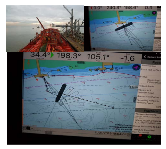
Figure 7. Example of a near miss during unmooring under strong current.

Break away from jetty procedures should be trained periodically. An example of a near miss during unmooring on Thames river – under strong current when the aft spring fail to let go is presented in Fig. 7.