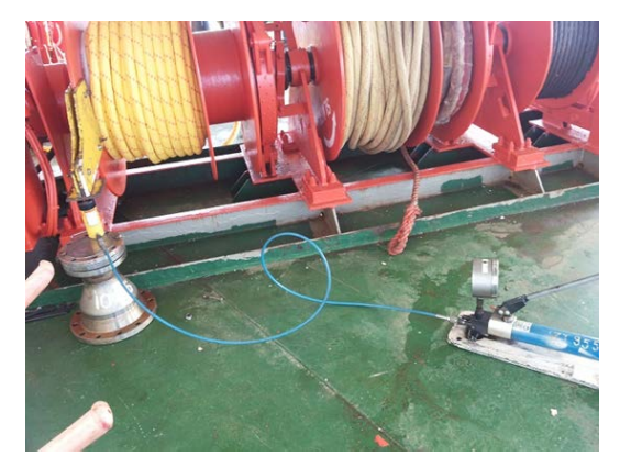
Figure 5.Winch brake test and calibration performed on chemical tanker.