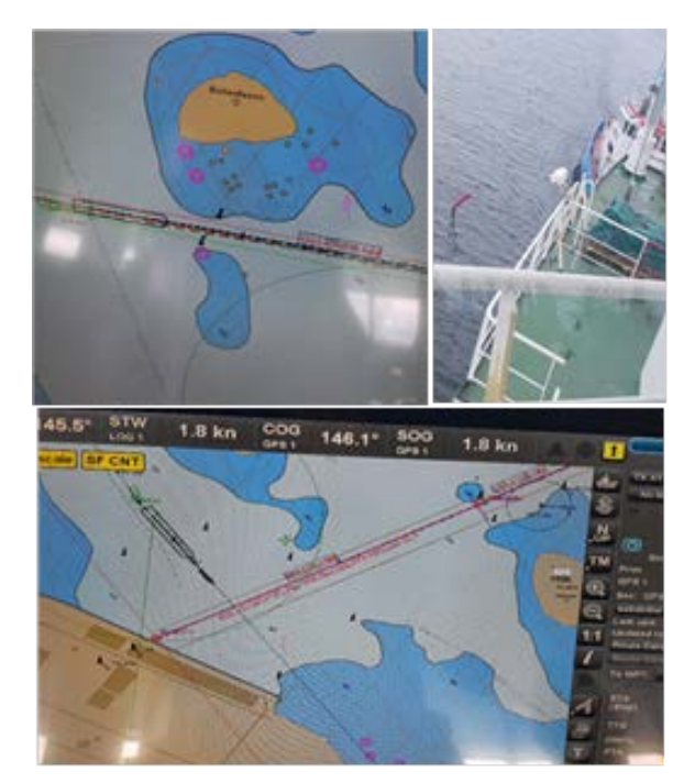
Figure 4. Tug assistance near rocky bottom with limited horizontal and vertical allowance.

Tug assistance is an effective measure of reducing risk in restricted waters and port approaches. In some ports due to horizontal (tight bends, narrow channels) and vertical (UKC) limitations tug assistance is compulsory and tug is made fast before entering rocky and narrow fairway. Tug boat is usually connected but idle (Fig. 4).