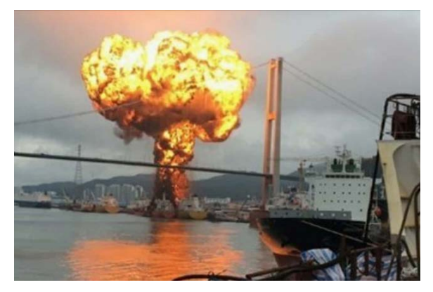
Figure 1. Chemical tanker explosion due to vigorous self-reaction of Styrene Monomer [12].

The explosion of a chemical tanker as a result of a violent self-reaction of styrene monomer shown in Fig. 1 illustrates the scale of hazards associated with cargo on chemical tankers.