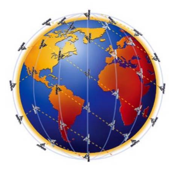
Fig 4. Constellation of the Iridium System.

municate with neighbouring satellites via Ka band inter-satellite links. Each satellite can have four inter-satellite links: two to neighbours fore and aft in the same orbital plane, and two to satellites in neighbouring planes to either side. The satellites orbit from pole to pole with an orbit of roughly 100 minutes. This design means that there is excellent satellite visibility and service coverage at the North and South poles, where there are few customers. The over-the-pole orbital design produces "seams" where satellites in counter-rotating planes next to one another are traveling in opposite directions. Crossseam inter-satellite link hand-offs would have to happen very rapidly and cope with large Doppler shifts; therefore, Iridium supports inter-satellite links only between satellites orbiting in the same direction. [7].