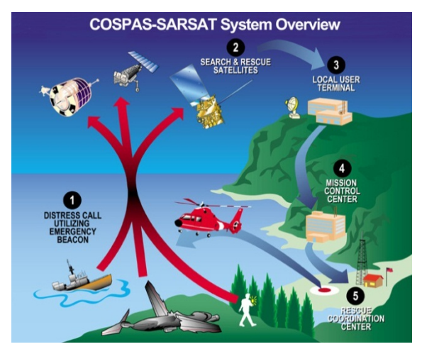
Fig.1. COPAS-SARSAT System Overview.

This satellite system was initially developed under a Memorandum of Understanding among Agencies of the former USSR, USA, Canada and France, signed in 1979.